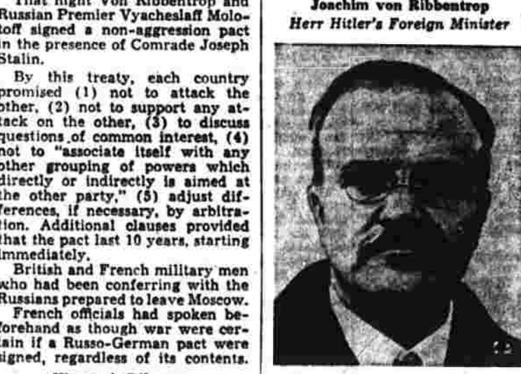
Joseph von Ribbentrop, Herr Hitler's Foreign Minister

The Treaty's Terms That night Von Ribbentrop and Russian Premier Vyacheslav Molotov signed a non-aggression pact in the presence of Comrade Joseph Stalin. By this treaty, each country promised (1) not to attack the other, (2) not to support any attack on the other, (3) to discuss questions of common interest. It did not "associate itself with any groupings of powers," but directly or indirectly is aimed at the other party. (4) adjust differences, if necessary, by arbitration. Additional clauses provided that the pact last 10 years, starting from the day of its signing. When it was signed, it was hailed as a "miraculous" event. "It is a step toward peace," said one observer. "It is a step toward peace," said another. "It is a step toward peace," said a third.